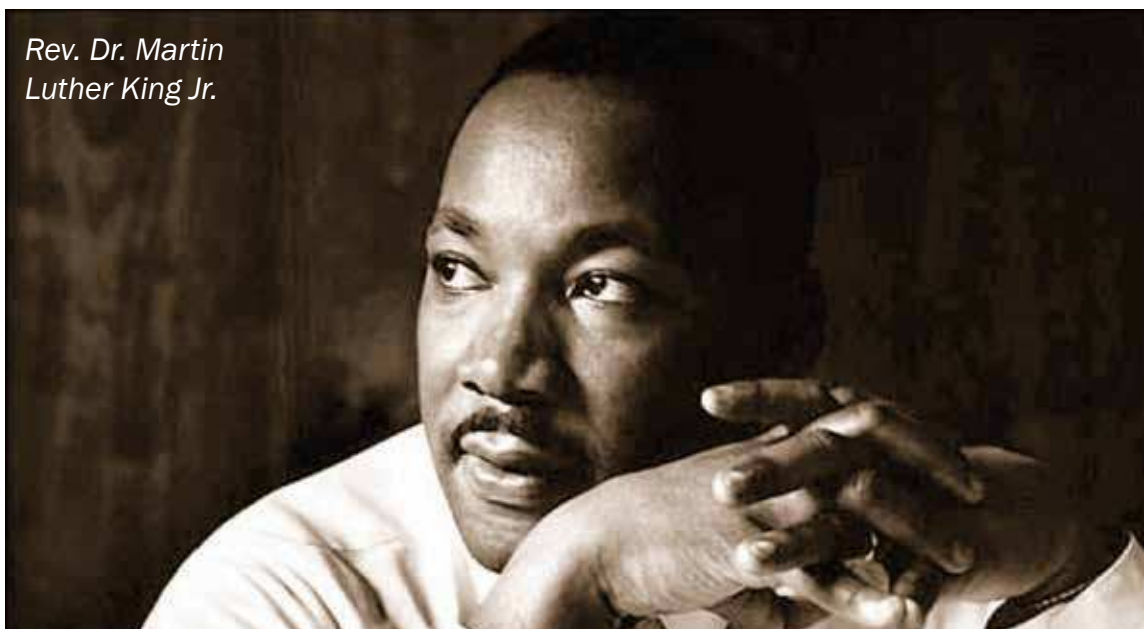
Rev. Dr. Martin Luther King Jr.

Entry is $5 or a donation of five units of non-perishable food. Guests are welcome to spend the day enjoying the variety of musical and entertainment acts, but also take in the adjacent Victory Village and Bazaar which offers a full range of arts, crafts, services, educational materials, food, photographs, films, and a culturally rich network of arts and education advocates ready to offer assistance to visitors.