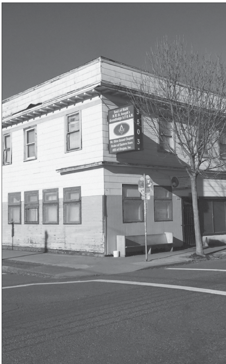
The Sons of Haiti Masonic Lodge on North Mississippi Avenue needs your help to keep its doors open.