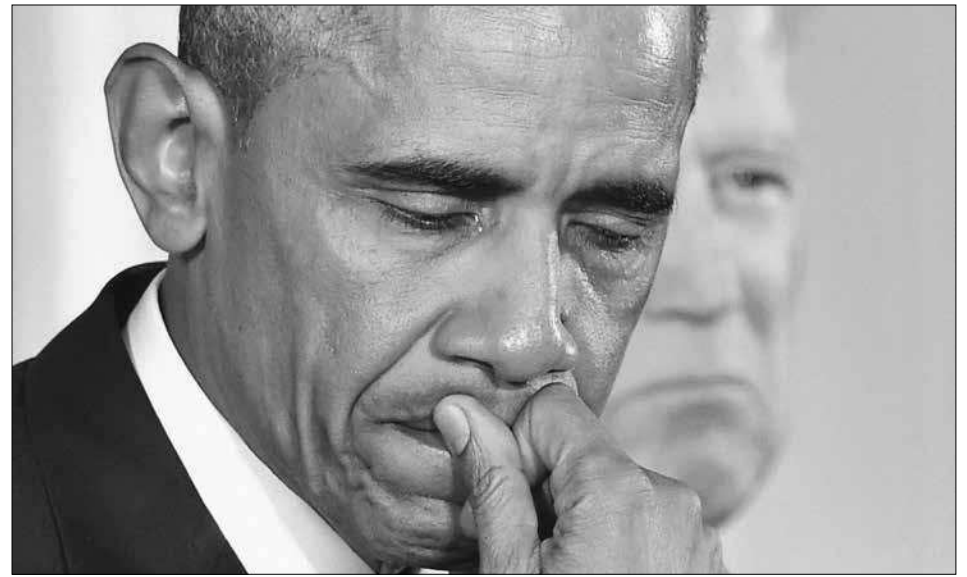
President Obama gets emotional as he speaks Tuesday on reducing gun violence during a meeting at the White House.

“Every time I think about those kids it gets me mad,” Obama said as his eyes welled-up with tears. “And by the way, it happens on the streets of Chicago every day.”