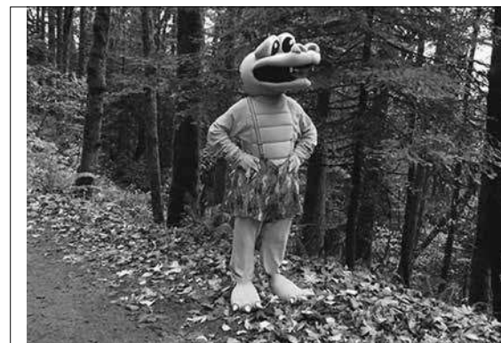
Portland's 'Wader the Gator' issues a fitness challenge.