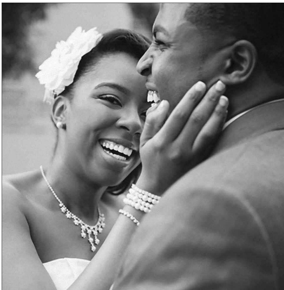
The New Year opens the process for reserving space in Portland's parks for weddings and commitment ceremonies.