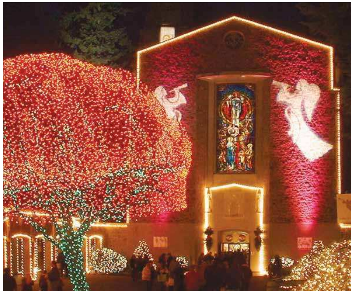
Over 800 volunteers go in to make the annual Christmas Festival of Lights at The Grotto come alive. The celebration runs every night, except Christmas day, through Wednesday, Dec. 30.

Your contribution is tax-deductible to the extent allowed by law.