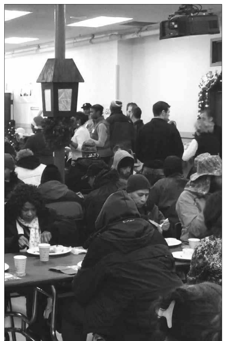
Hundreds of people who are homeless or in need are served during the 2014 Christmas Day meal at the Union Gospel Mission, downtown.