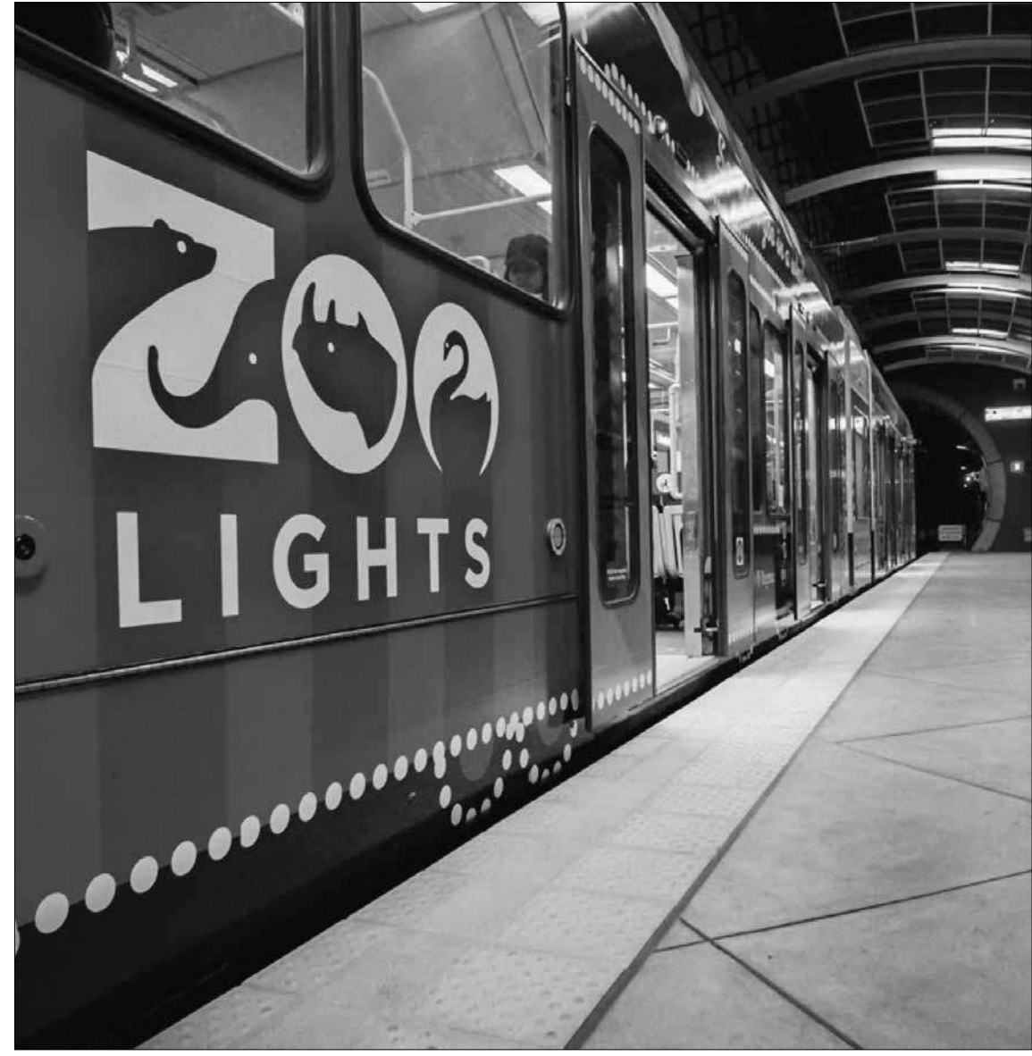
A MAX train advertising the holiday ZooLights festival pulls into the Washington Park station near the Oregon Zoo. ZooLights visitors who take MAX receive an admission discount of up to $5 per person.