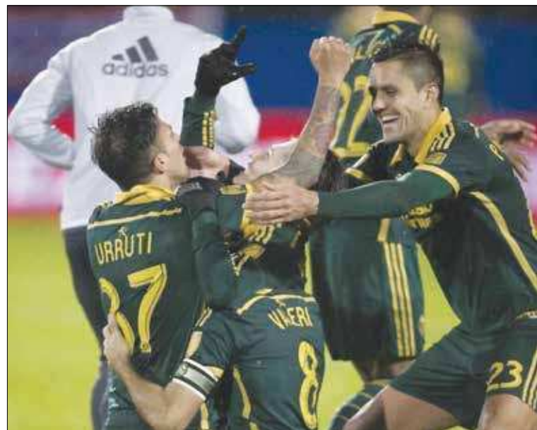
The Portland Timbers celebrate winning the Western Conference championship against FC Dallas at Toyota Stadium in Dallas, Texas. The win puts Portland in the title match for the MLS Cup championship on Sunday against Columbus Crew SC in Columbus, Ohio.

This will be the second MLS Cup championship game hosted in Columbus; San Jose beat the LA Galaxy 2-1 in the 2001 final. Early forecasts for Sunday's weather call for mostly sunny skies and a