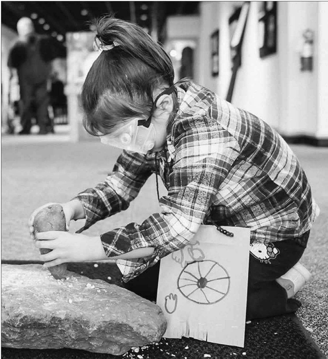
A young visitor tries her hand at splitting acorns during a Native American Heritage Month event at the Water Resources Education Center in Vancouver.