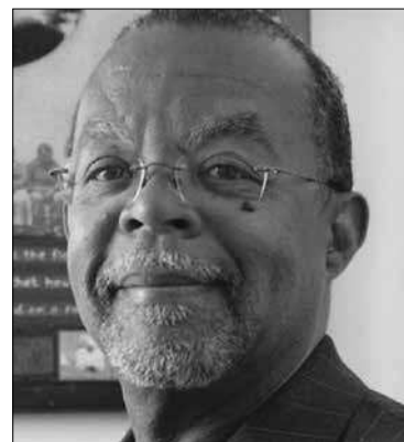
Henry Louis Gates Jr.

Gates, a Harvard professor and host of the PBS series of the same name, raises disturbing and vital questions about this dichotomy. How did the African American community end up encompassing such profound contradictions? And what will "the black community" mean tomorrow?