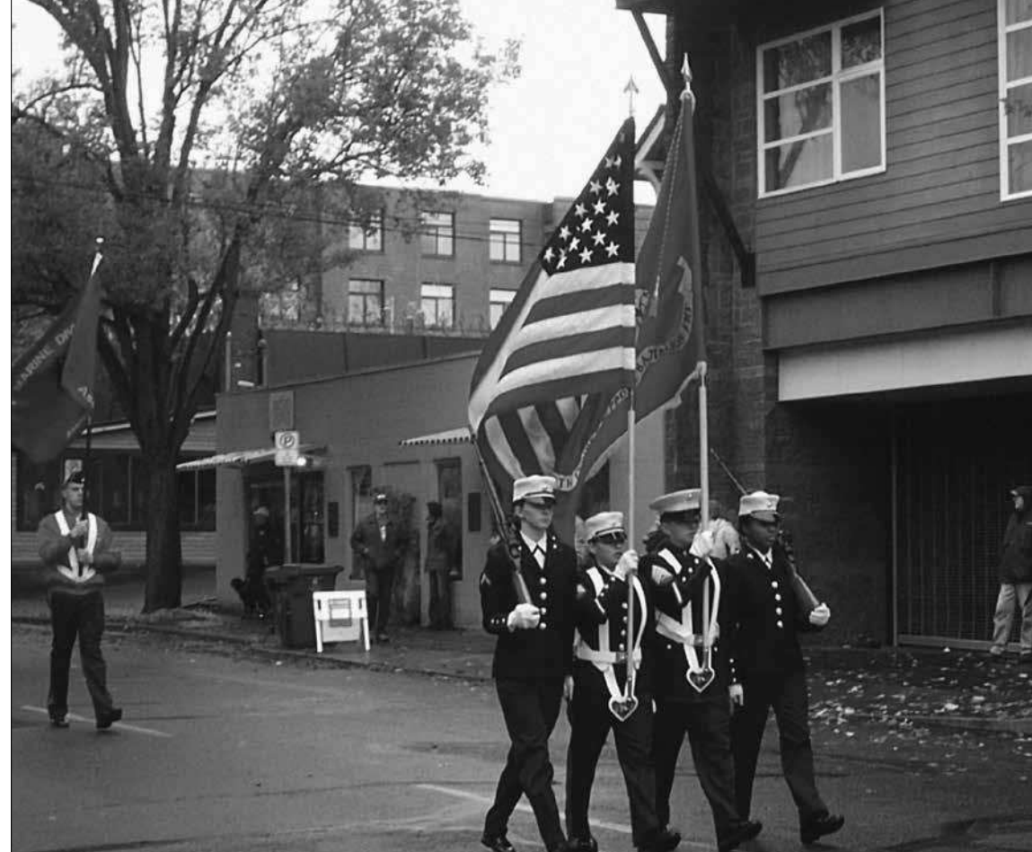
Portland's traditional Ross Hollywood Chapel Veterans Day Parade is held each year along Northeast 40th Avenue and Sandy Boulevard. The annual event returns Wednesday, Nov. 11 starting at 9:45