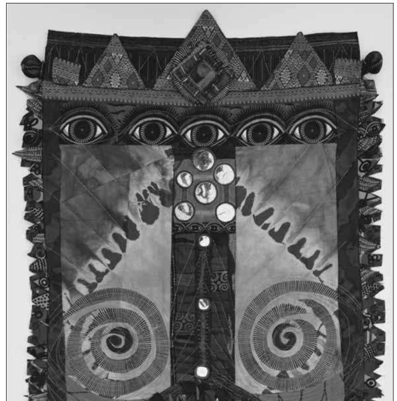
Adriene Cruz creates textiles with a passion for color and texture.

Advertise with diversity in The Portland Observer Call 503-288-0033 email ads@portlandobserver.com