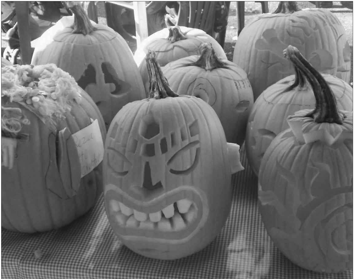
Pumpkin carving for kids and adults will take place at the Portland Farmers Market at King School Park in northeast Portland Sunday, Oct. 25, and again at the market's Portland State University location, downtown, on Saturday, Oct. 31.

The Great Pumpkin event at the PSU market, downtown, will be held on Saturday, Oct. 31, with a pumpkin-carving contest for kids and adults from 9 a.m. to noon. Prizes include a market basket for the best child carving ($40 value) and $50 in market tokens for the best adult carving. A children's costume parade starts at noon All costumed kids receive a goody bag for dressing up. Entertainment will be provided by the Hops & Honey String Band from 11 a.m. to 2 p.m.