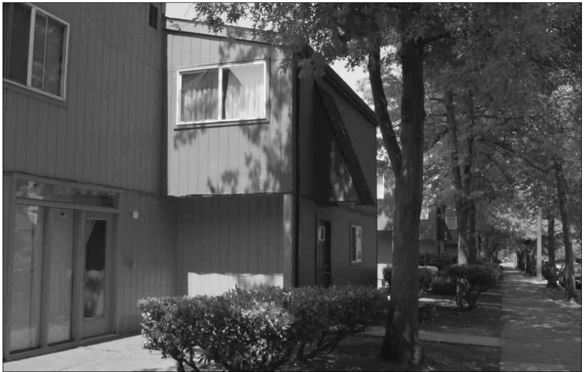
The Plaza Townhomes, a longtime housing complex for low income residents at North Michigan Avenue and Jessup Street, will get a major upgrade and new ownership that guarantees the apartments will remain affordable for the next 45 years.

Thousands gathered in the nation's capital Saturday, calling for racial and socioeconomic equality and to mark 20 years since the first Million Man March organized by Minister Louis Farrakhan.