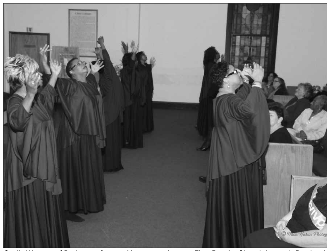
God's Women of Praise perform at Vancouver Avenue First Baptist Church in north Portland to bring awareness to the Worship in Pink campaign for breast cancer awareness.