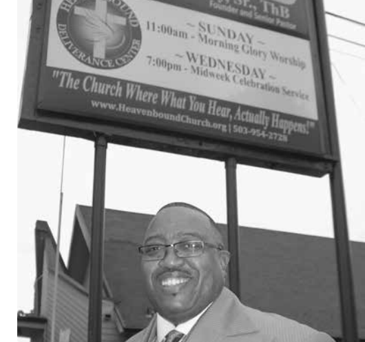
page 11 METRO