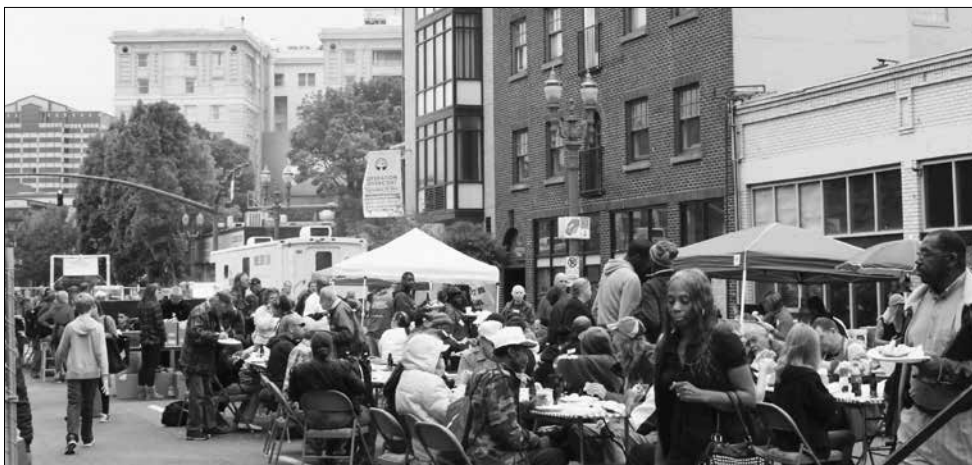
Crowds outside the Union Gospel Mission, downtown, at last year's Operation Overcoat Street Fair.

Friends of Trees is hiring a full time Program Specialist. Visit FriendsofTrees.org/Job-Opportunities to apply.