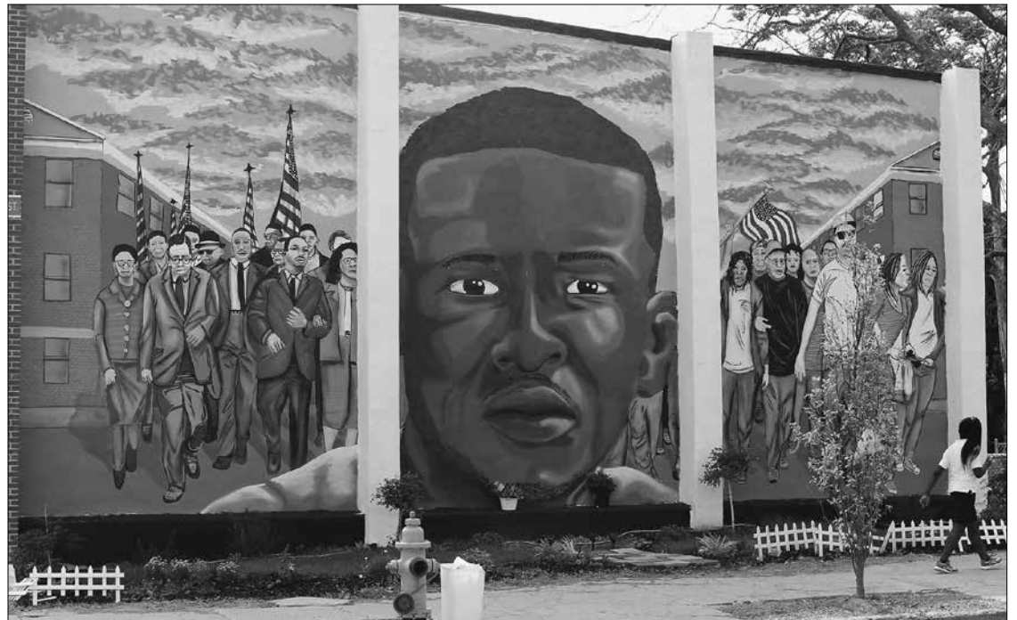
A mural memorializing Baltimore resident Freddie Gray adorns a wall near the place where he was tackled and arrested by police.