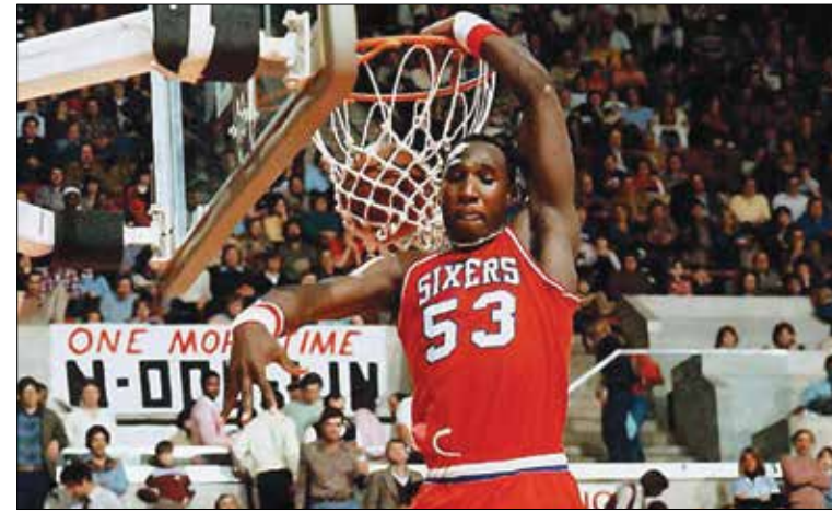
Ex-NBA star Darryl Dawkins, a.k.a. 'Chocolate Thunder' died last week at the age of 58.

lete and ferocious dunker," former the 76ers.