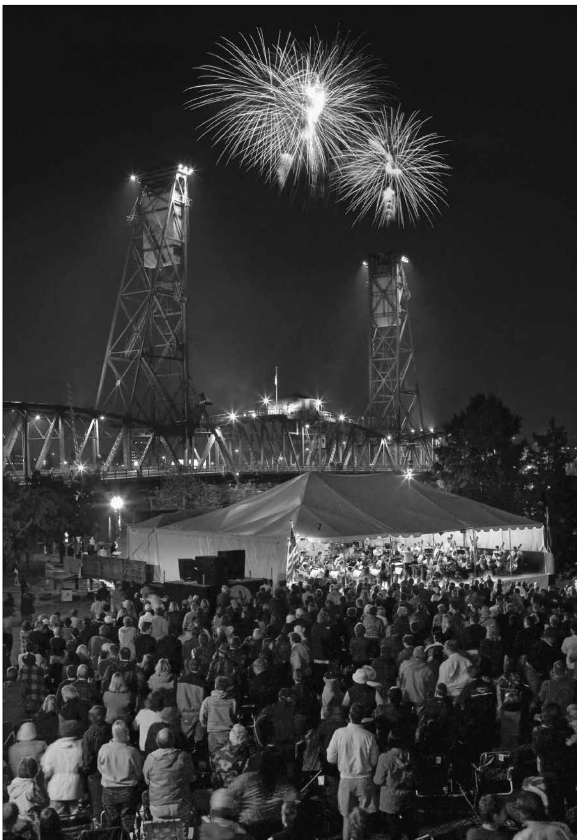
The Oregon Symphony and fireworks cap off the annual Waterfront Concert, a day-long event returning to Tom McCall Waterfront Park, downtown, on Thursday, Sept. 3. The concert includes a stellar line up of musicians and youth orchestras.