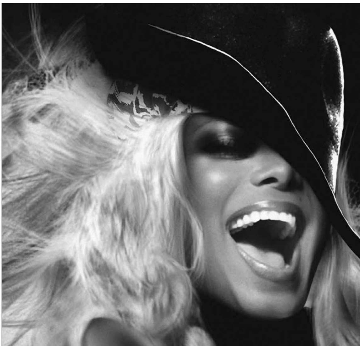
Janet Jackson, one the most successful recording artists in all of contemporary music, comes to Portland this January.