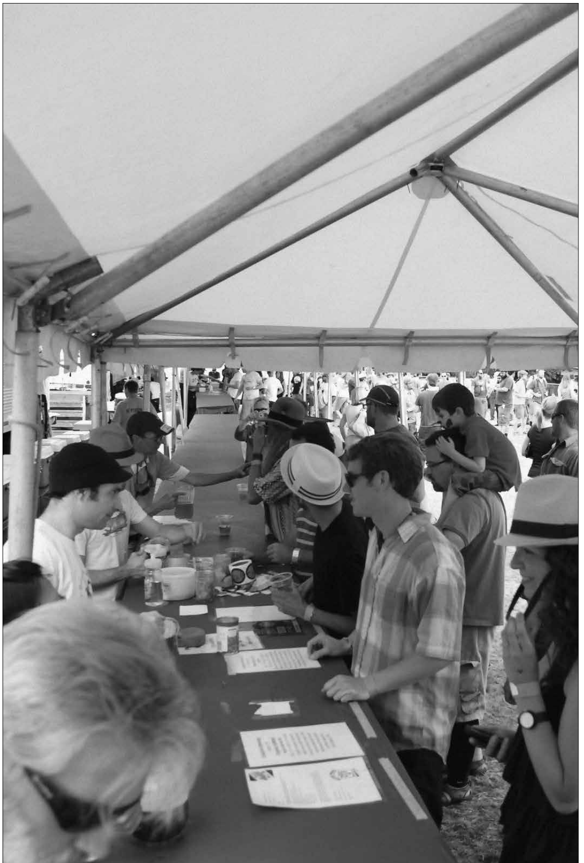
The Organic Brewers Festival returns to Overlook Park in north Portland, Thursday, Aug. 13 through Sunday, Aug. 16.