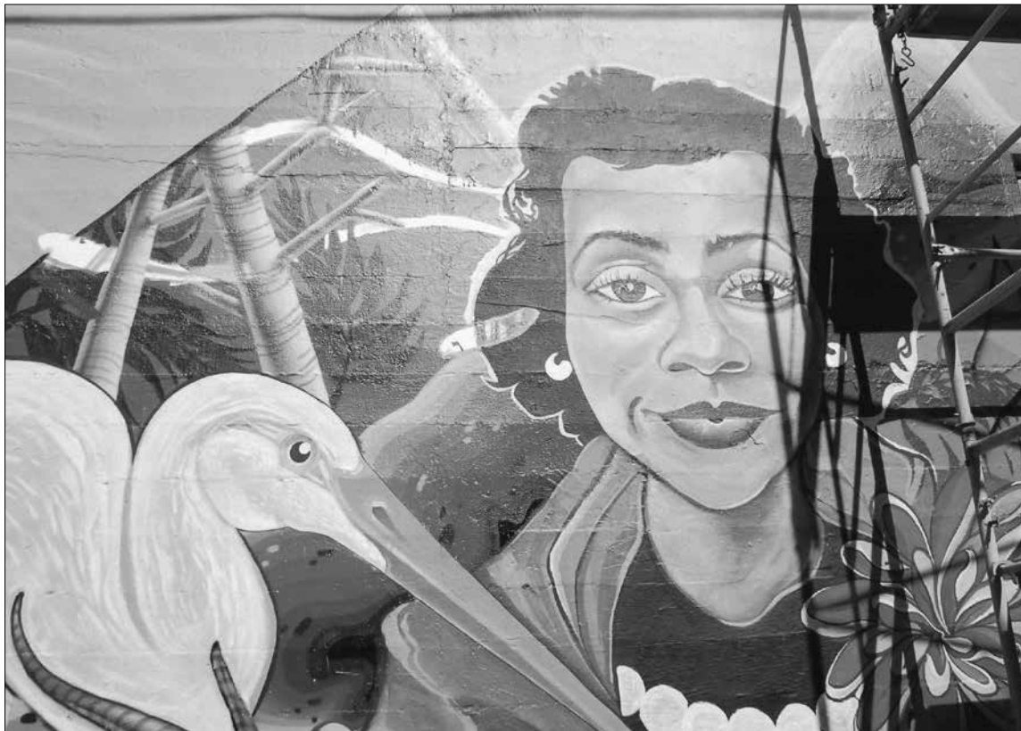
The Black United Fund of Oregon will host a Saturday, Aug. 8 celebration to unveil a new mural on its building at 2828 N.E. Alberta St.

Despite the efforts of over 800 firefighters, the 8,500-acre Stouts Fire east of Roseburg, was still growing Tuesday forcing residents from rural homes. Firefighters were also fighting another fire approximately 40 miles north of the Stouts blaze, which is being called the Cable Crossing fire.