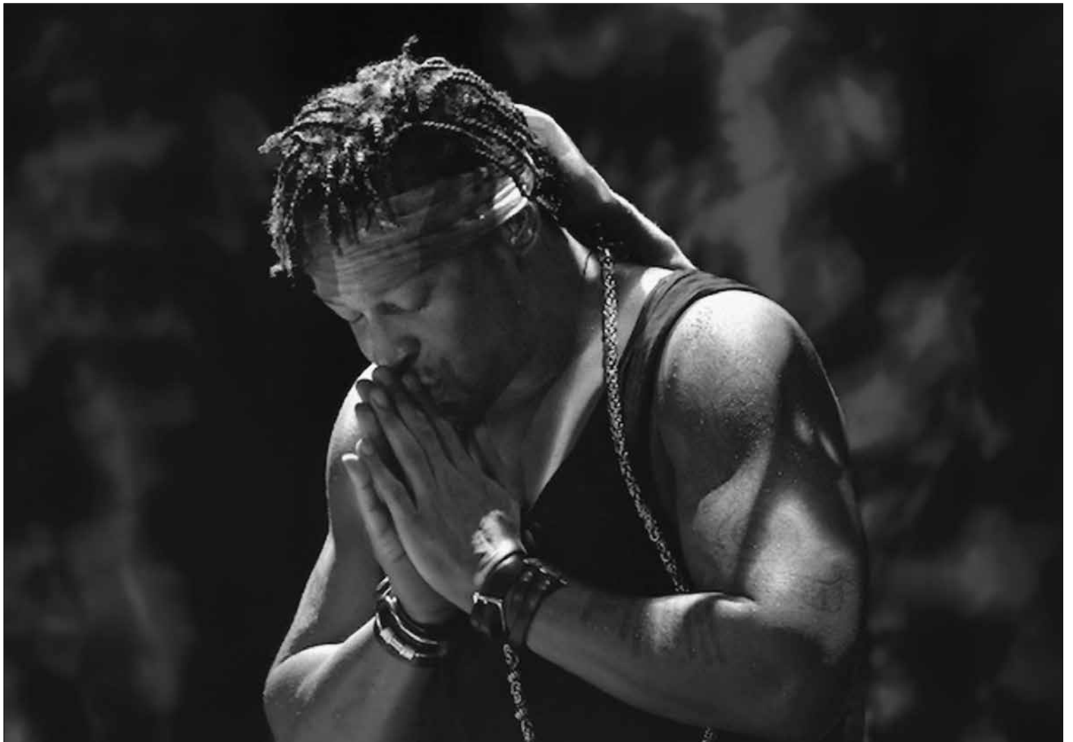
Singer and songwriter D'Angelo comes to Portland this Sunday.

D'Angelo plays with his opening act, The Vanguard , this Sunday, Aug. 9, at McMenamin's Crystal Ballroom, downtown. Doors open at 7:30 p.m. with the show starting at 8:30 p.m. The show is 21+ only, with tickets starting at $59.95 in advance, $65 on the day of the show. For more information, visit crystalballroompx.com/events/141209-DAngelo-and-The-Vanguard .