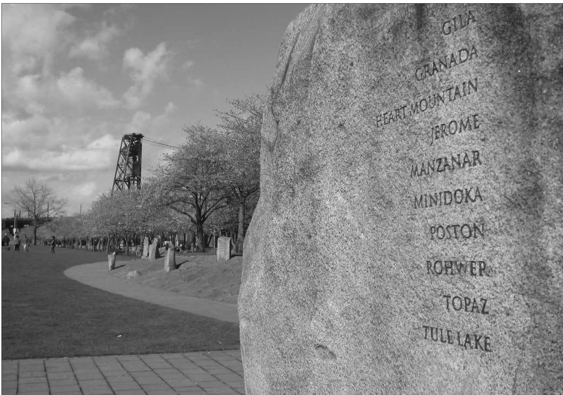
A public celebration on Sunday, Aug. 2 will mark the 25th anniversary of the Japanese American Historical Plaza and Bill of Rights Memorial on the downtown waterfront.