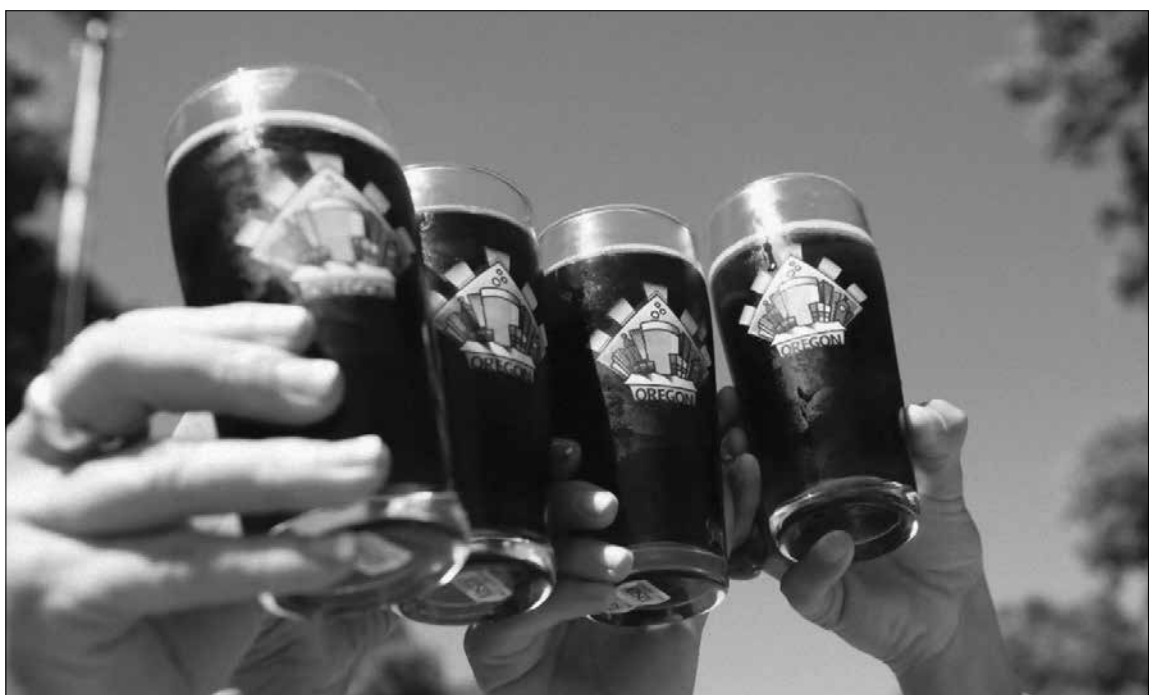
The Oregon Brewers Festival returns to Tom McCall Waterfront Park, Wednesday, July 22 through Sunday, July 26.