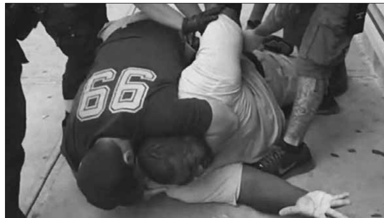
A video that went viral in July 2014 showed a restrained Eric Garner lamenting "I can't breathe" while New York police officer Daniel Pantaleo wrestled him to the ground.

An officer, Daniel Pantaleo, placed his arm around Garner's neck to take him to the ground.