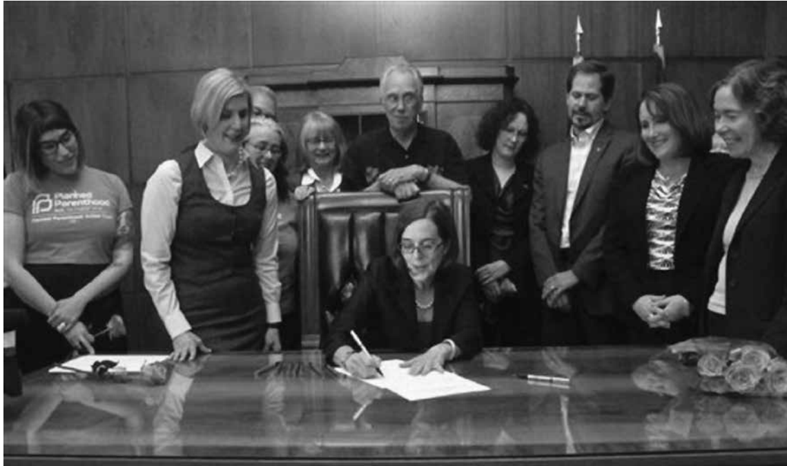
Gov. Kate Brown signs a bill expanding access to contraception during a June 11 ceremony. The bill makes Oregon the first state to require insurers to pay for up to 12 months of birth control at a time.

The law banning the practice of profiling as a law enforcement tactic is on its way to Gov. Kate Brown's desk for her signature. The bill offers residents a formal complaint process and creates a new work group tasked with identifying patterns or practices of profiling, along with identifying