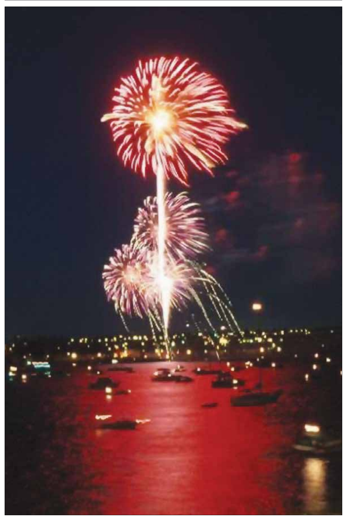
Independence Day at Fort Vancouver is marked by a full day of family fun with live music, games and entertainment, culminating in a spectacular fireworks show.