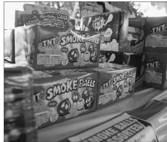
Residents are reminded to use extreme caution with fireworks.

Temperatures this weekend are expected to hit well into the 90s, which means that people without air conditioning should look for way to stay cool.