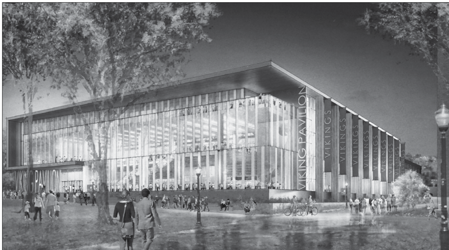
An artist's rendering shows the Viking Pavilion and Education Center coming to the Portland State University campus.