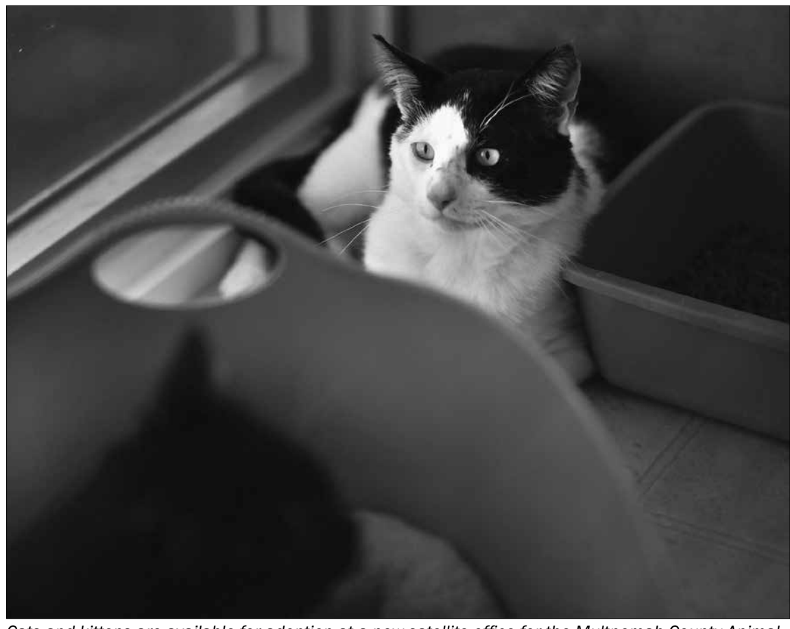
Cats and kittens are available for adoption at a new satellite office for the Multnomah County Animal Services, located at 2914 N. Lombard St., just east of Greeley Avenue.