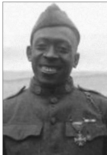
U.S. Army Sgt. Henry Johnson of the 369th Infantry Regiment.

In a tearful, joyful East Room ceremony recalling the battlefield triumphs as well as the prejudices of 20th century America, Sgt. William Shemin and Pvt. Henry Johnson were recognized Tuesday with the nation's highest military decoration for saving their comrades on French front lines. Shemin was Jewish and Johnson was black.