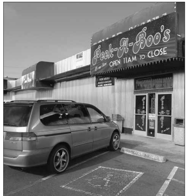
A strip club at the Town Plaza in the Cully Neighborhood has been identified as part of an indictment charging the owners of eight adult businesses in Portland of defrauding the IRS of $1.5 million and promoting prostitution.

The grand jury also charged Owen with con-