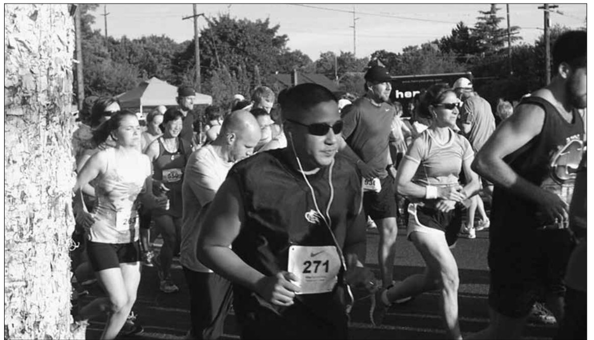
The Martin Luther King Dream Run is a world-class event held each summer in the heart of Portland's Soul District. Over the next few weeks, several free 'dreamwalks' are planned to prepare for the fourth annual event, Aug. 1 and 2.