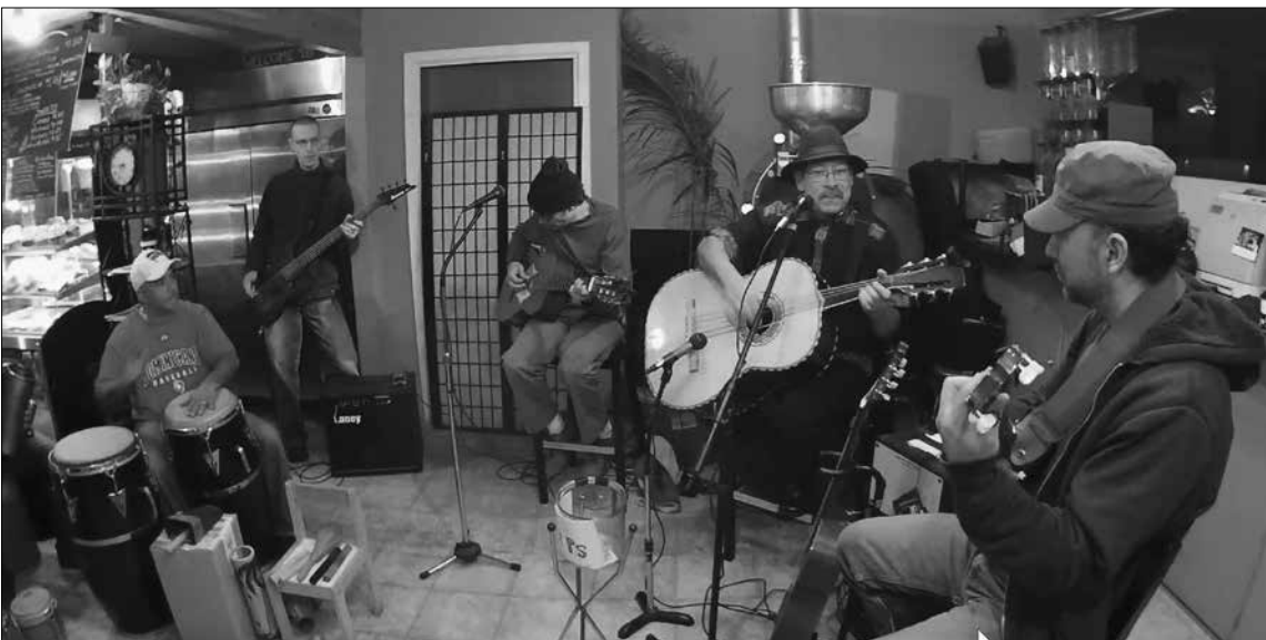
A. J. Java, 6425 N. Albina Ave., hosts a summer series of free concerts every Friday, from 6 p.m. to 9 p.m.