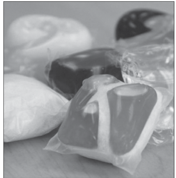
Laundry detergent packets inside squishy encasements are sometimes mistaken for toys or candy by children, landing more than 700 children in the U.S. in the hospital in just two years, researchers report.

Exposure to household cleaning products is among the top reasons for calls to poison centers involving young children