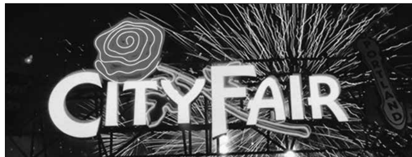
CityFair, the Portland Rose Festival waterfront celebration, opens Friday for the three day Memorial Day weekend, and then opens again for two more extended weekends as the Rose Festival comes into full swing.

Franklin students will attend school on the disbanded Marshall High School Campus for two years during construction.