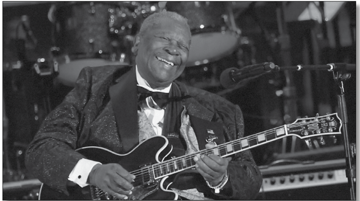
B.B. King performs in Los Angeles on Friday, June 20, 2008.

Meyer Memorial Trust has retained The 360 Group of San Francisco to assist with this search. Please visit http://www.the360group.us/MMT_PDRSS_PD.pdf to review the complete position description, including detailed application instructions. No calls, please. To be considered, The 360 Group must receive applications no later than 5:00pm Pacific time on Wednesday, June 17th, 2015.