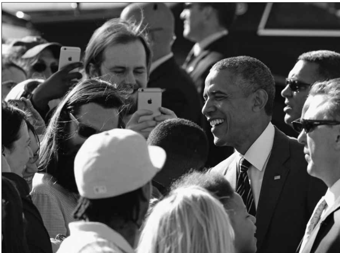
President Obama arrives at the Portland Air National Guard base where he is greeted by well wishers.