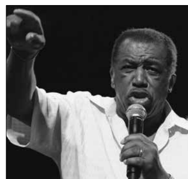
Ben E. King

A Home Going Celebration will be held Saturday, May 9 at 11 a.m. at Morning Star Missionary Baptist Church, 4927 N.E. 55th Ave. For inquires, call 503-891-5812.