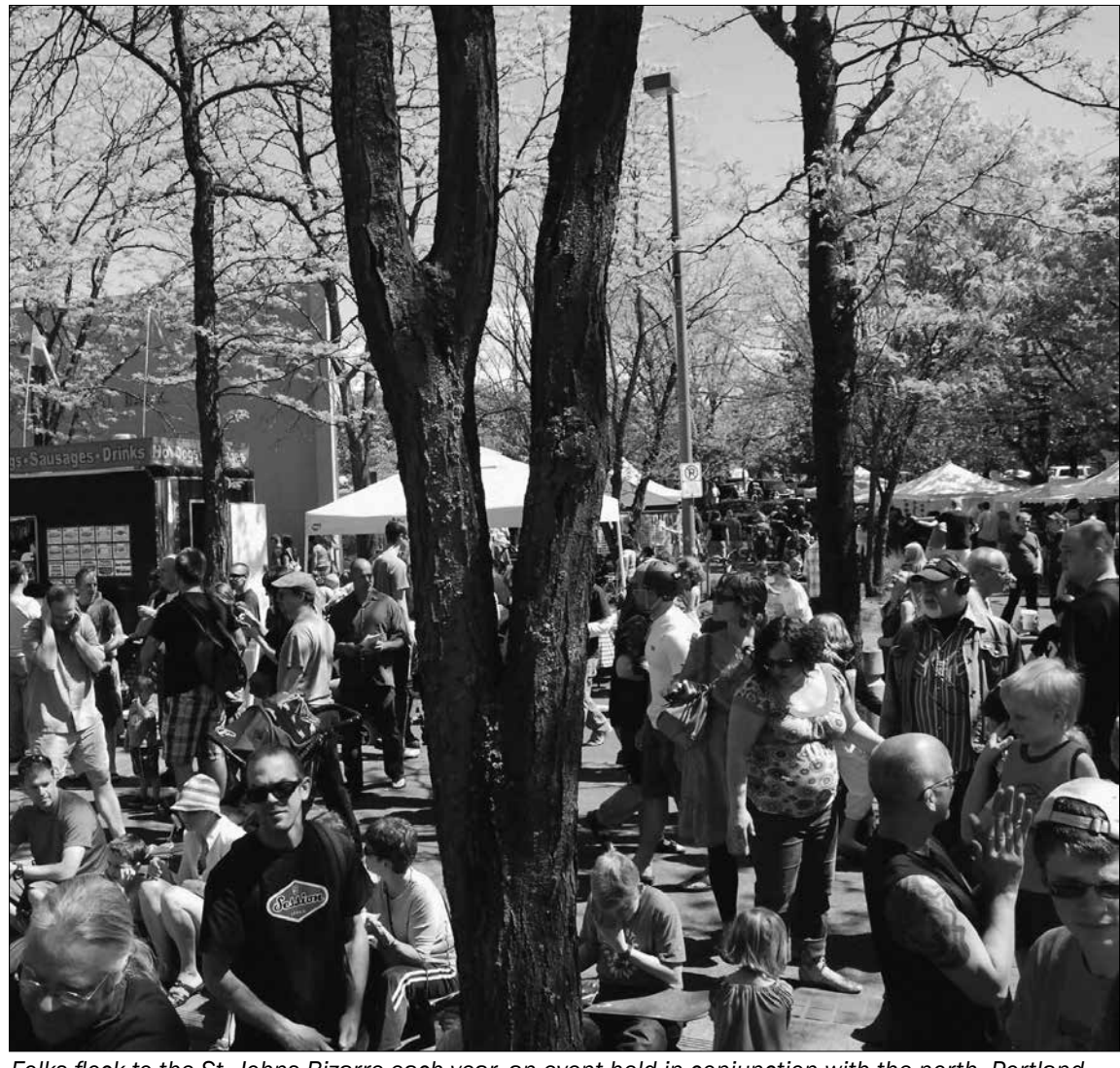
Folks flock to the St. Johns Bizarre each year, an event held in conjunction with the north Portland neighborhood's annual St. Johns Parade. Both events return on Saturday, May 9.