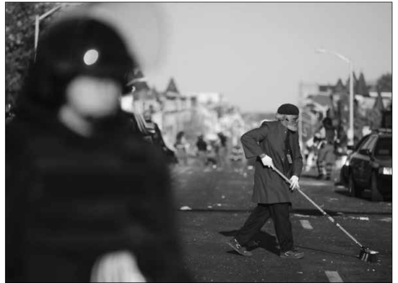
Residents clean streets as law enforcement officers stand guard Tuesday in Baltimore in the aftermath of rioting.

"I think there are police departments that have to do some soul-searching. I think there's some communities that have to