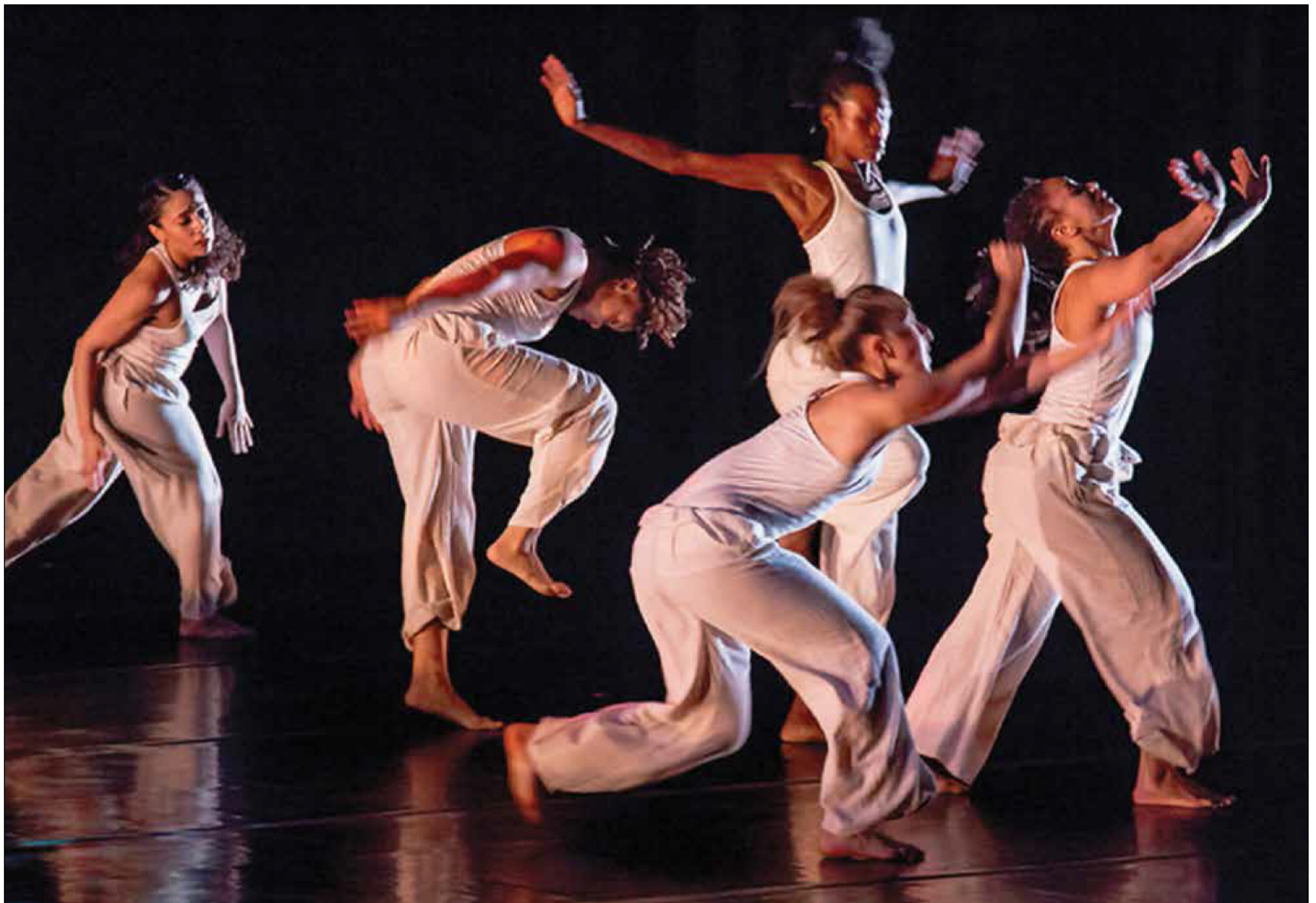
The award-winning Brooklyn-based dance company 'Urban Bush Women' present three nights of powerful works inspired by John Coltrane, Kansas City jazz greats, and the Civil Rights Movement, Thursday, April 9 through Saturday, April 11 at the Newmark Theater, downtown.