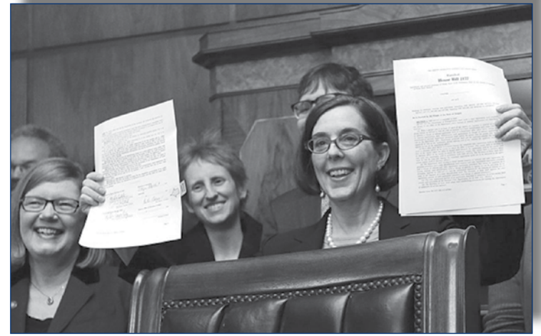
Oregon Gov. Kate Brown holds up an automatic voter registration bill after signing it Monday in Salem.