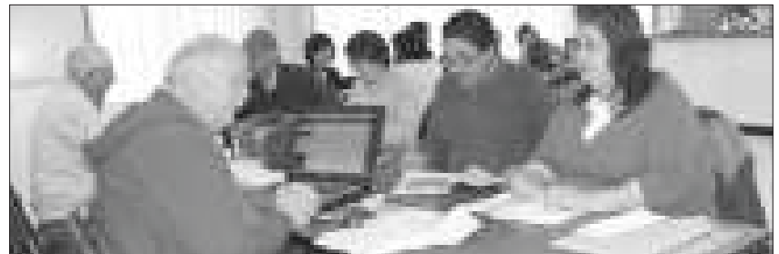
The AARP helps low-income families and individuals prepare their taxes free of charge throughout the United States.