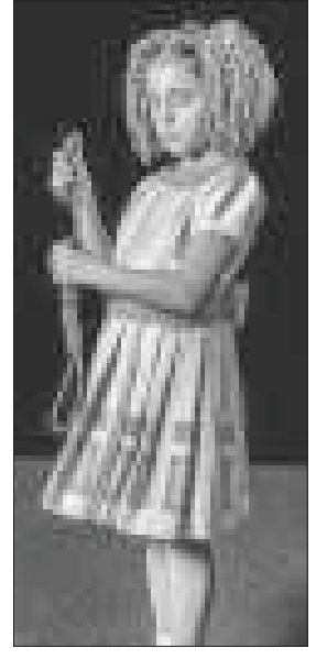
Stumptown Stages with the hilarious award winning musical