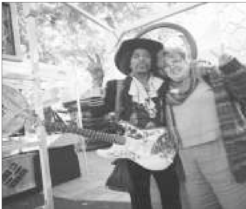
Portland's Saturday Market is a showcase of homemade products and good eats punctured by live entertainment from street musicians and other artists. Located in Old Town, the market opens Saturday for its 42nd year.