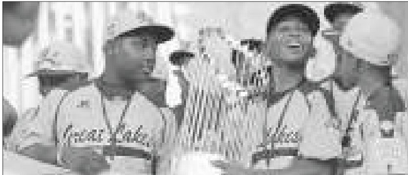
Members of the Jackie Robinson West Little League baseball team in Chicago celebrate the team's U.S. Little League Championship last summer.