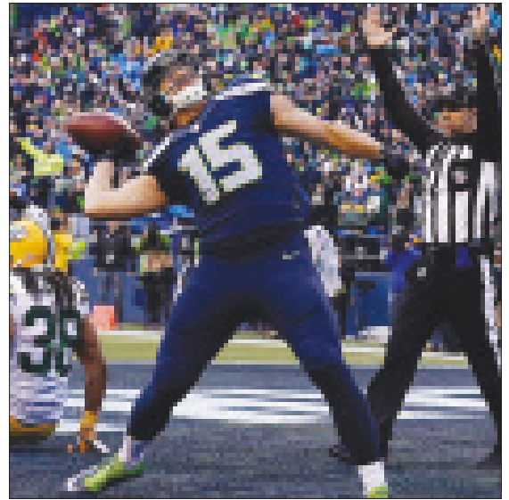
Seattle Seahawks' Jermaine Kearse celebrates after catching the game-winning touchdown during overtime of the NFL football NFC Championship game against the Green Bay Packers Sunday in Seattle. The Seahawks won 28-22 to advance to Super Bowl XLIX.